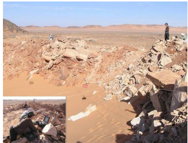
Using ground-penetrating radar to study the impact crater.