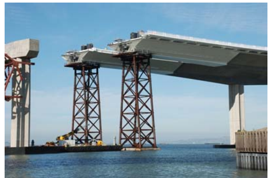
E2 on the left, with temporary scaffolding supporting the new bridge.

The next “stop” was by the E2 pier, where both ends of the single suspension cable will be anchored. Here we learned of another unconventional aspect of the construction. With typical suspension bridges, the suspension cables are hung first, and the sections of roadbed are attached afterward. For this bridge,