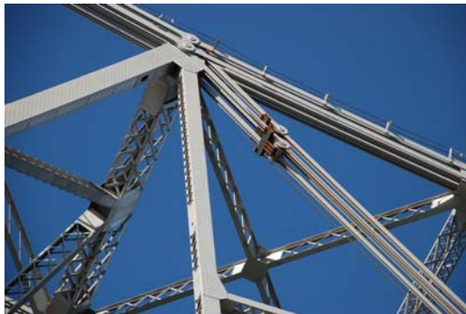
The cracked I-Bar and the temporary fix that failed the day after our trip.

the steps are reversed. “Scaffolding” is being built to support sections of the roadbed as they arrive (by ship). They will be lifted into place to sit on top of the scaffolding. Next, the single cable will be hung and connected to the bed sections. Then, the scaffolding will be removed. Essentially, “two bridges are being built to get one”. From this vantage, we also could see a cross section of the prefabricated sections of roadbed that have already been put in place. A large open space 30’ tall will run the length of the bridge, through its interior. In addition to providing access for repair to the fuses in the hinge pipe beams, there are water and power conduits, restrooms and storage facilities for equipment....all inside the bridge. Fantastic! We were also able to view wire perches hung from the underside of the new span, for the cormorants that will be displaced from their current accommodations on the old bridge, when is torn down.