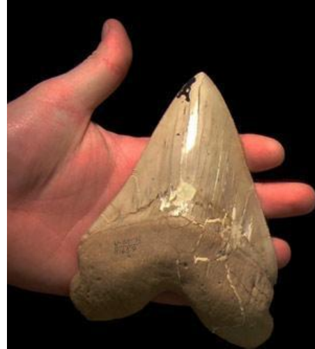
Teeth such as this from the extinct 40-foot-long shark Carcharocles megalodon are common in the Sharktooth Hill Bone Bed because, like modern sharks, these extinct sharks also shed teeth throughout their lives.

The mix of shark bones and teeth, turtle shells three times the size of today's leatherbacks, and ancient whale, seal, dolphin and fish skeletons, comprise a unique six-to-20-inch-thick layer of fossil bones, 10 miles of it exposed, that covers nearly 50 square miles just outside and northeast of Bakersfield.