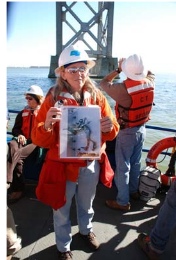
Bay Bridge Goblin

fashioned into a goblin, about eight inches tall. It was secretly attached to the side of the upper deck, a signature, of sorts, inscribed by the workers. From our vantage, it looked like a smudge of grease. But a photograph was passed around to show the details of the little dancing devil.