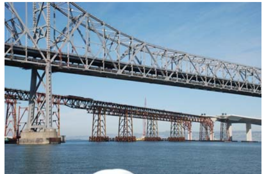
With the old / existing bridge in the foreground, the temporary scaffolding almost obscures the E2 pier.

(ESA’s). An ESA for aquatic life is designated here to protect eel grass from being harmed by the construction. Buoys outline areas of growth. On the tip of Yerba Buena, directly under the new construction is a structural ESA, to protect a torpedo bunker dating from World War II. Further onshore is a cultural ESA, where artifacts of Ohlone Indians, including 4” long obsidian spear points and shell beads, have been recovered. From this vantage, we were able to see rusty, steel “scaffolding” which was used over Labor Day to slide sections of the old bridge out of the way, so that the “S curve” could be replaced, diverting traffic so that construction on the new tunnel approach could be started. We also viewed the W2 pier, anchored in Franciscan bedrock on Yerba Buena. One of the unique designs of the new bridge involves the use of a single suspension cable that will be anchored within the decks of the bridge at the eastern end. This single cable will wrap around and be held by the W2 pier. A short distance away, we got an excellent view of the T1 pier and foundation, where the SAS tower will stand.