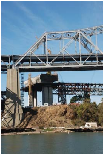
With the old / existing bridge in the foreground, the W2 pier can be seen in the background along with a portion of the temporary scaffolding that is used to slide the new road sections in to place. The bedrock in the foreground was conclusively determined to be our outcrop for the day.

At around 2:15, the information session ended, and the group got outfitted with hard hats, safety glasses and life jackets. The group was then met by Jordona Jackson , who was to be the guide on the boat tour. We walked outside to find a perfect Bay Area October afternoon of warm sun, no wind, and calm, fog-free water on the bay. After boarding the boat, we motored to Yerba Buena, where we viewed the “T1 foundation” for the soon-to-be-built tower for the Self-Anchored Suspension (SAS) portion of the bridge. The boating portion of the tour was a challenge. Where is the best place to be on a small boat with 28 people? Near the railing for the best photo-ops, or near Jordona to hear her wealth of information about the project?