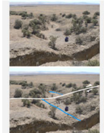
The southeast channel of the Bidart Fan/Carrizo Plain, has been offset 16 meters by 5 quakes.

The studies were conducted at the Carrizo Plain, 100 miles north of Los Angeles and site of the original "Big One"--the Fort Tejon quake of 1857--by scientists at Arizona State University (ASU) and the University of California at Irvine (UCI).