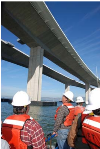
Taking it all in!

The next “stop” provided an excellent view of the section of the old bridge damaged during the LPE. Piston-like elements have been attached diagonally across the upper and lower deck, to repair and strengthen the section. Steel salvaged from the repair by construction workers was artistically