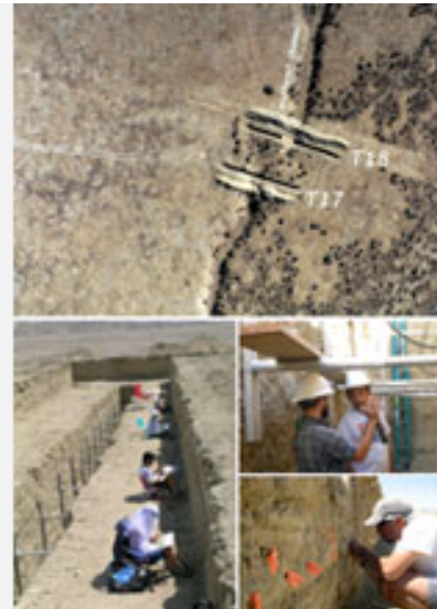
This montage includes an aerial view from a balloon and researchers at work at the Carrizo Plain.

Before these studies, the magnitude 7.8 Fort Tejon earthquake of 1857 (the most recent earthquake along the southern San Andreas Fault) was thought to have caused a nine-to-ten meter slip along the Carrizo Plain.