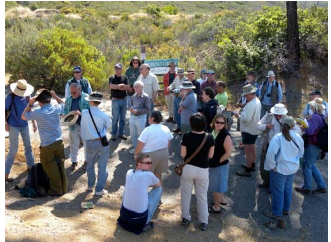
Figure 7. NCGS miners prepare to hike up to the Mariposite Quarry.