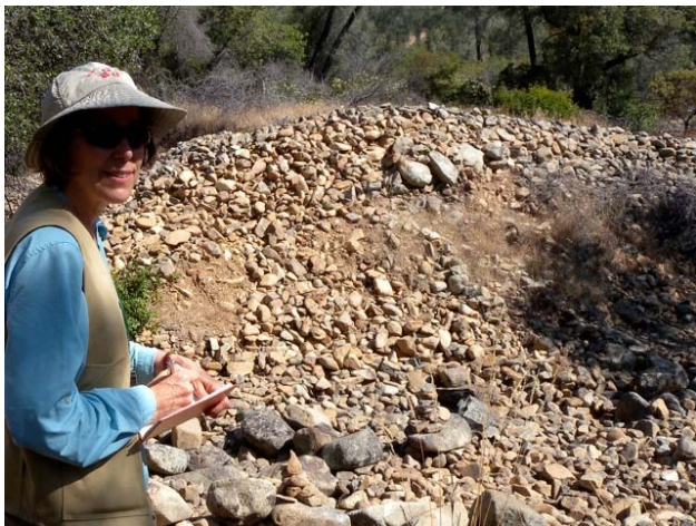
Figure 5. Mystery of the displaced rounded rocks.

Piles of rounded boulders curiously line some sections of Highway 49. We stopped at Moccasin Creek to understand why. The specific gravity of gold is 19.3 \text{ g/cm}^3 ; for sand and gravel only 2.6. Gold migrates to the lowest point in an area, often a streambed, where it settles at the bottom. The most obvious way to get at it is to redirect the stream if needed, then manually take out every single rock, dig up all the sediments, and scoop up the thin layer of gold.