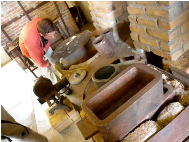
Figure 3. The retort room, where the amalgam of gold and mercury was converted into solid gold ingots for shipment to San Francisco.

The Kennedy mine was operational until 1942, when all mines were closed to free up labor for the war effort. During its operation, it produced $34,280,000 of gold. See http://www.kennedygoldmine.com/ for more information.