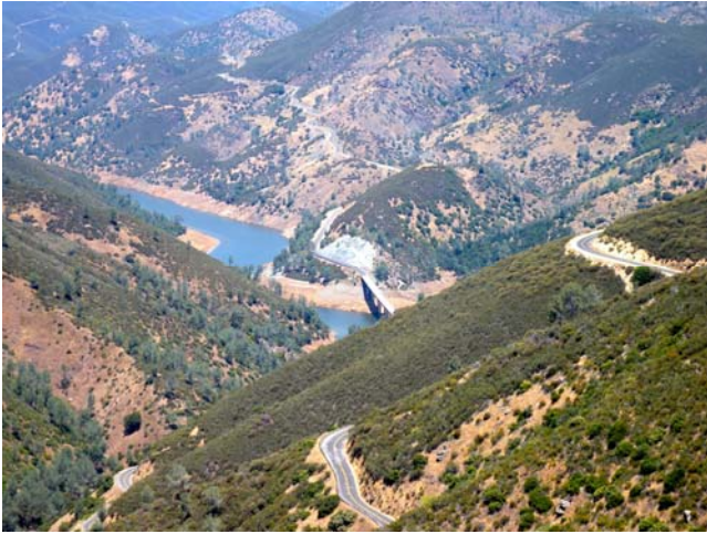
Figure 8. View of to the north of where we came on Hwy 49, along strike of the Mariposa Formation. Note serpentinite in roadcut to the east just past the Bagby Bridge over the Merced River.