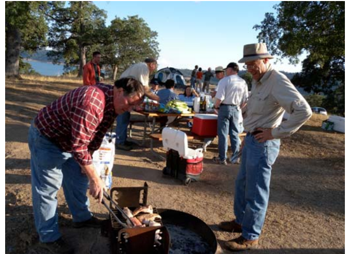
Figure 4. BBQ at the campsite. Perfect weather, view over the New Melones Lake, on the Stanislaus River.

After dinner, as twilight was falling, Ross gave us a talk on the origin and occurrence of gold.