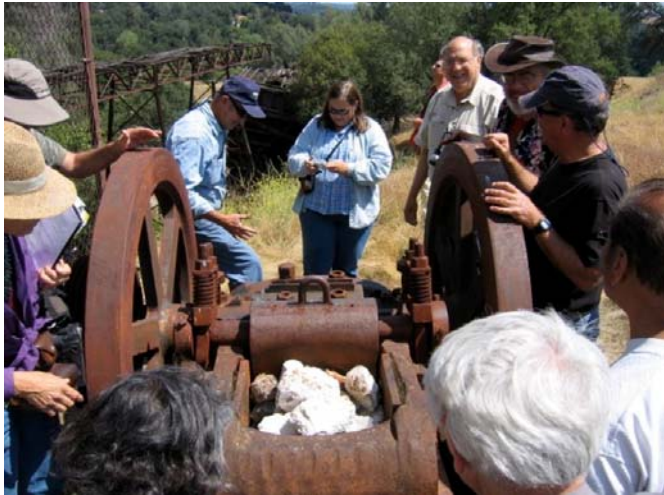
Figure 2. Inspecting a “jaw crusher” at the Kennedy mine.

The Kennedy mine was operational until 1942, when all mines were closed to free up labor for the war effort. During its operation, it produced $34,280,000 of gold. See http://www.kennedygoldmine.com/ for more information.